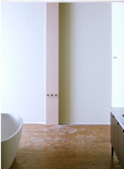
Ready for weather-resistant barrier.