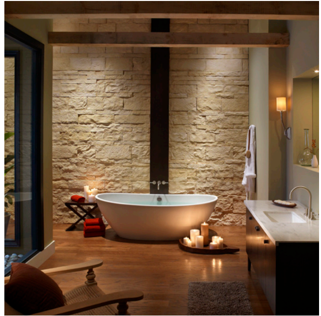
After: The ZenWall dramatically changes the mood of the room.