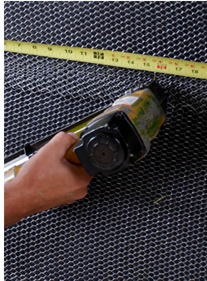
Attach lath to weather-resistant barrier.