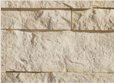
Oyster CUT COARSE STONE™

The ZenWall showcased in this Idea Book uses Oyster Cut Coarse Stone. You may wish to use a different profile. The following profiles and colors are also recommended. Please visit: www.eldoradostone.com to view additional options.