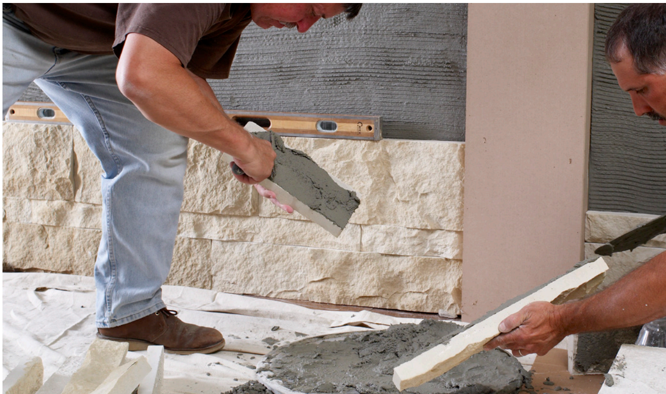
Apply a layer of mortar to back of veneer. Start at the bottom and work up. Consult eldoradostone.com for detailed installation instructions.