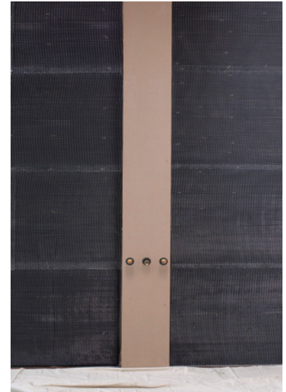
Wall ready for mortar scratch coat.