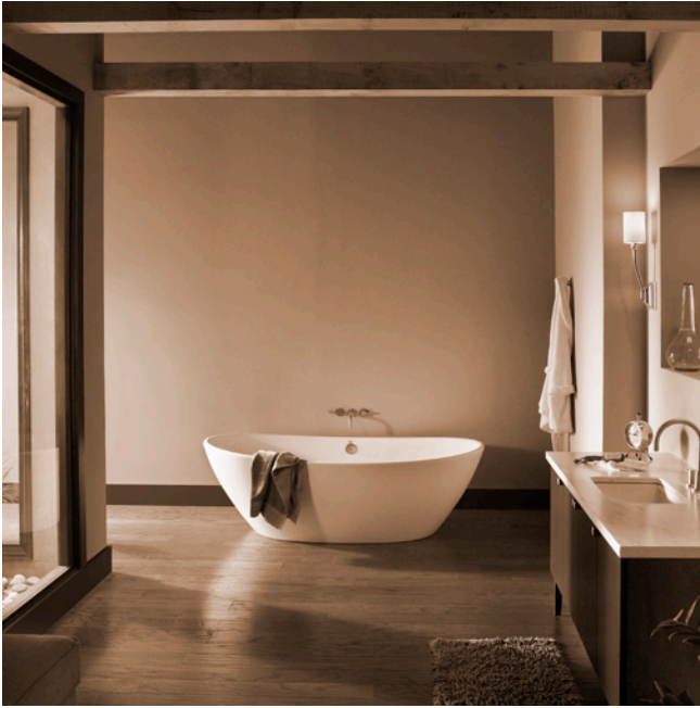
Before: The bathroom featured a traditional design.