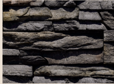
Black River STACKED STONE