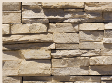
Dry Creek STACKED STONE