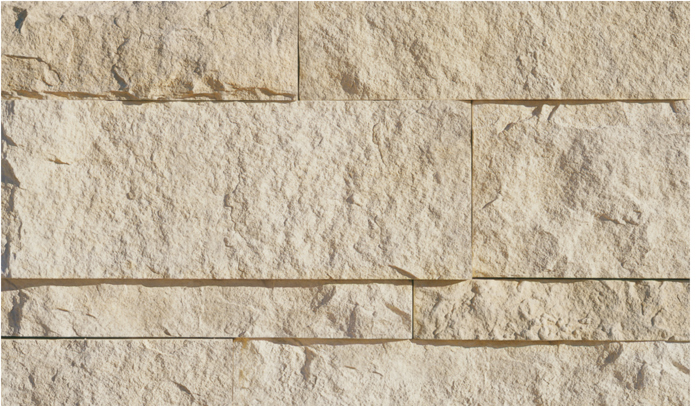
Dry-Stack grout technique with Oyster Cut Coarse Stone was specified for the ZenWall represented in this Idea Book.