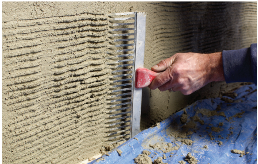
Score mortar horizontally.