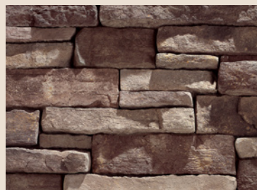
Bitterroot MOUNTAIN LEDGE