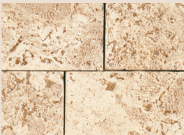
Pearl White COASTALREEF™