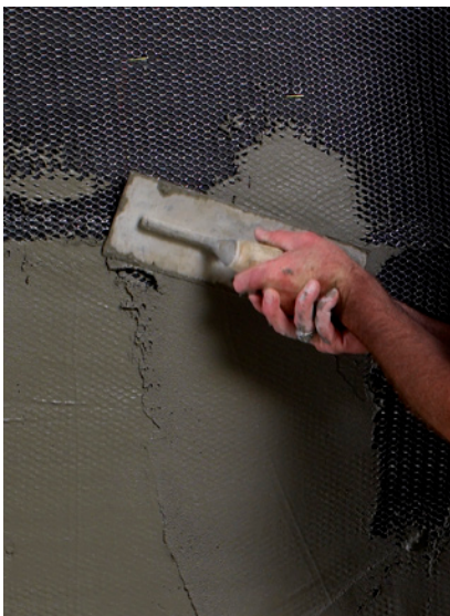
Cover entire lath with mortar.