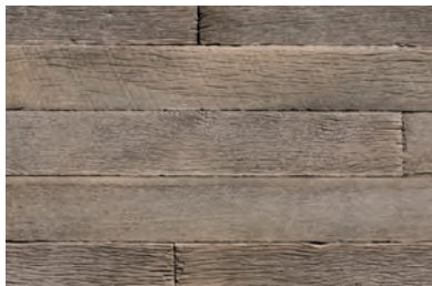
Weathered Plank 4