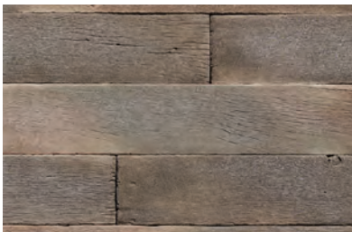
Weathered Plank 6