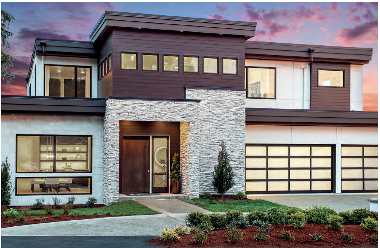
Eldorado Stone Marquee24 in Dove Tail and Stacked Stone in Daybreak

For more than 50 years, Eldorado Stone has pushed the boundaries of possibilities; harnessing nature's power and creativity to design a collection of premium architectural stone and brick veneer profiles. Handcrafted with artistic colors and expressive textures that verge from traditional to contemporary, Eldorado Stone products offer the ideal backdrop for curating indoor and outdoor spaces that lead to a lifetime of new moments to enjoy.