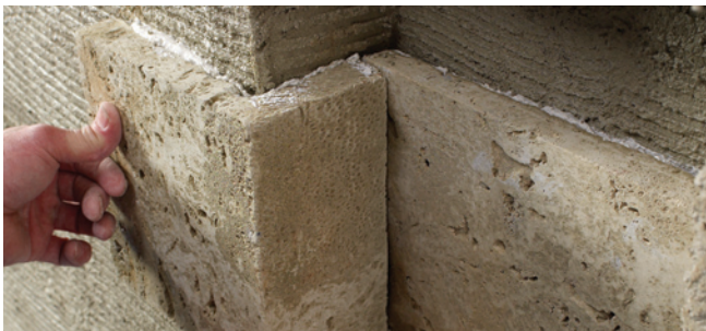
Top left: Moisten back of stone. Middle left: White mortar that matches profile is layered on back of stone. Above right: Stone applied to chalked wall from bottom up. Above: Keeping the stone level, wiggle into place.