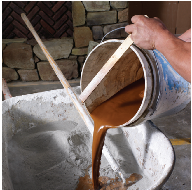
Above: Eldorado Stone recommends adding color to the mortar.

Eldorado highly recommends that multiple tests are done with some loose stones on a board before commencing grouting the actual wall.