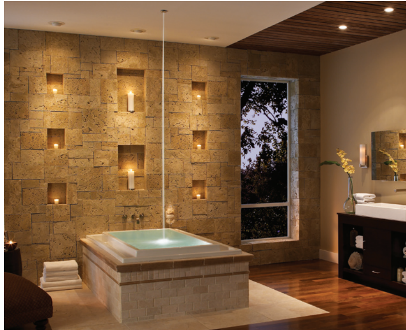
This CandleWall employs a Dry-Stack grout technique which requires no surface grouting.

Each piece is laid 0.5" apart. The grout should overlap the face of the veneer, widening the joints and making them very irregular. (See page 4.)