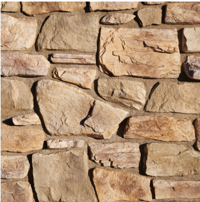
MOLANO Hillstone with a Standard grout technique. A Standard grout technique exposes the edge details of each stone.