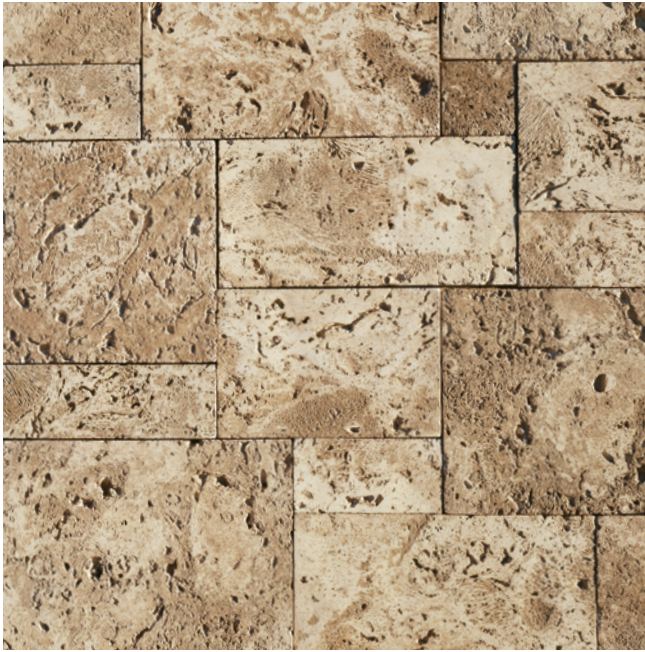
SANIBEL Coastal Reef with a Dry-Stack grout technique was specified for the CandleWall represented in this Idea Book.