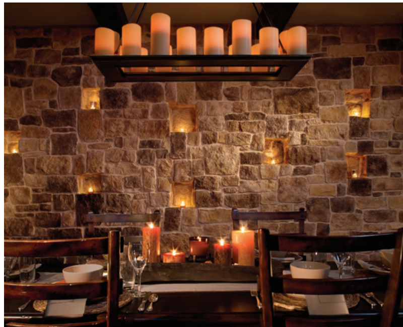
This alternate CandleWall, installed with Autumn Leaf RoughCut, uses an Overgrout technique.