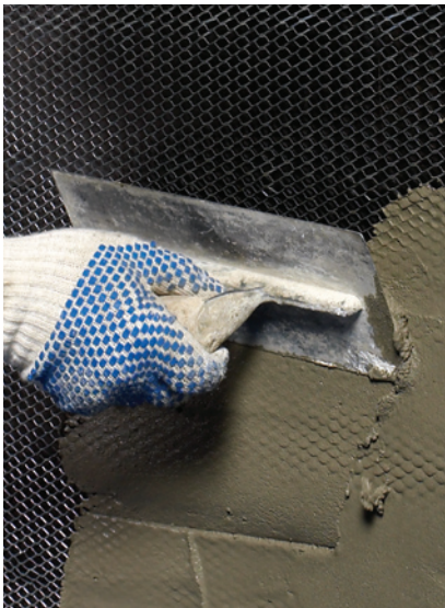
Cover entire lath with mortar.