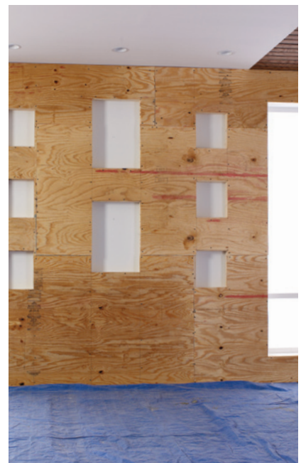
Wood stud framing over existing wall, location of candle niches and ply-wood sheathing.