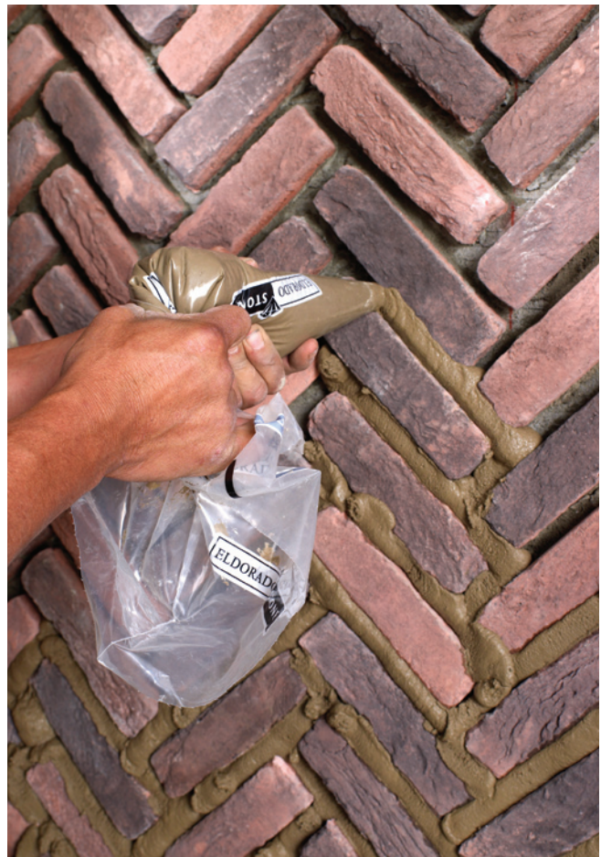
Below: Even though Eldorado Brick is being grouted in this picture, the theory is comparable when grouting Eldorado Stone.