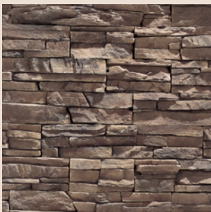
Santa Fe STACKED STONE®

The CandleWall showcased in this Idea Book uses Sanibel Coastal Reef. You may wish to use a different profile.