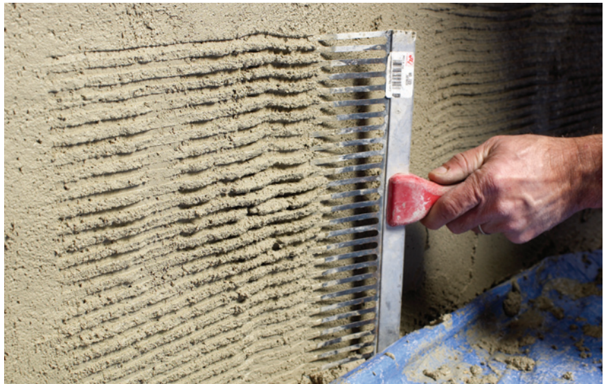
Score mortar horizontally.