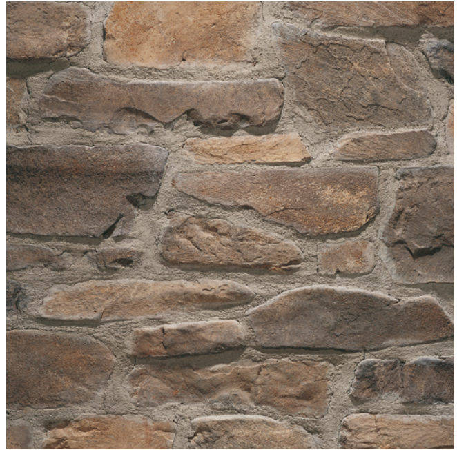
VENETO Fieldledge with an Overgrout technique illustrates how rustic and old-world the face appears when Overgrout is installed.