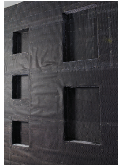
Wall ready for mortar scratch coat.