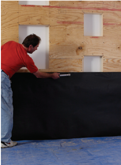
Install weather-resistant barrier.