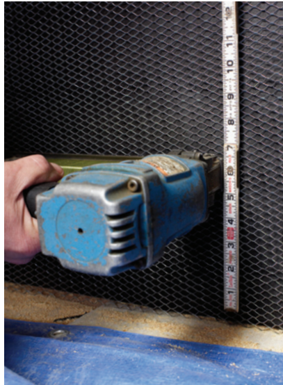
Attach lath to weather-resistant barrier.